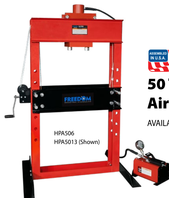
HPA506 HPA5013 (Shown)