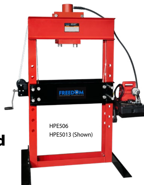
HPE506 HPE5013 (Shown)